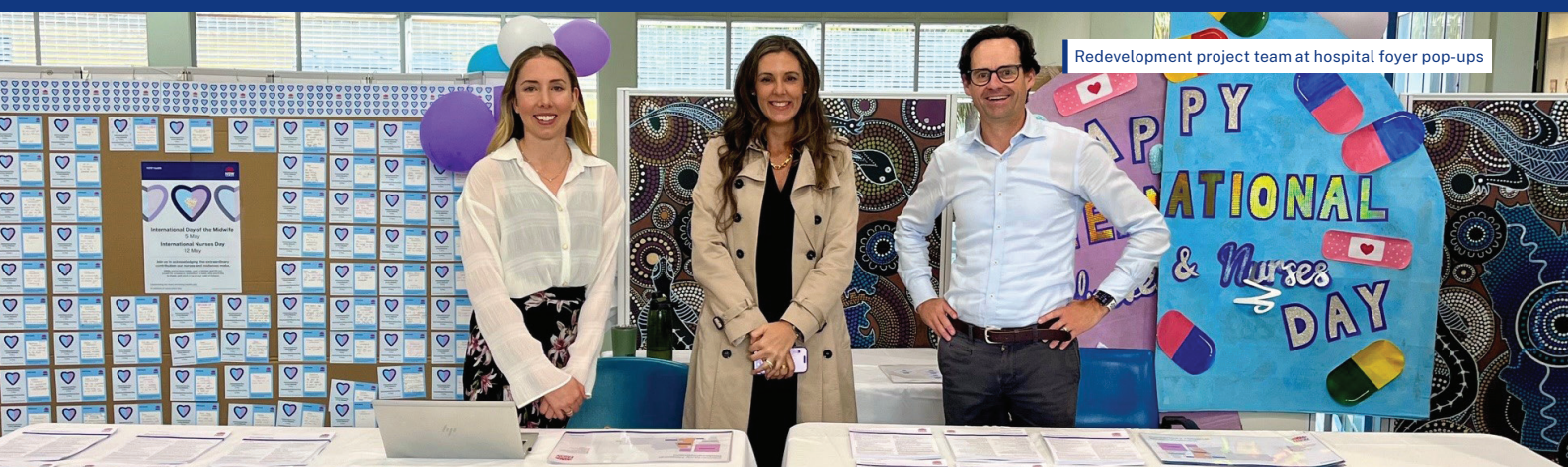
Redevelopment project team at hospital foyer pop-ups

The NSW Government is investing $350 million in the Canterbury Hospital Redevelopment to expand the facility and deliver upgrades to existing infrastructure. It will be the biggest upgrade to the hospital in more than 26 years, providing patients and staff with access to the latest facilities.