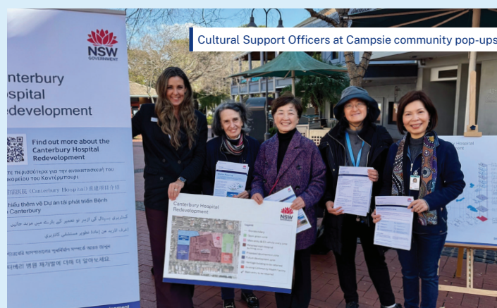
Cultural Support Officers at Campsie community pop-ups

The response from the community was overwhelmingly positive. Residents expressed excitement about the upgrades and appreciation for the opportunity to speak