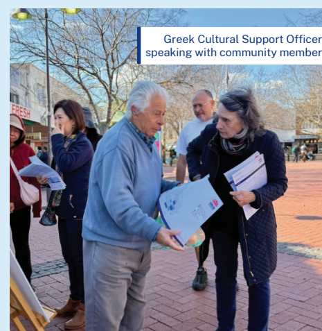
Greek Cultural Support Officer speaking with community member

Explore 'Have Your Say' at www.haveyoursay.nsw.gov.au/canterbury-hospital-redevelopment