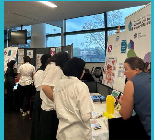
Students participating in excursion activities including the Health Circuit and laboratory experiments.

The Institute team hosted eight excursion days in November 2023, welcoming five local schools. We hosted a further two excursion days in June 2024. Our next program will be delivered in November 2024, with a plan to reach 300 students this year.